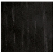
Nero poro aperto (Layer) Black open pore (Layer)