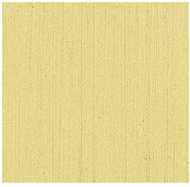
Ottone satinato Satin brass