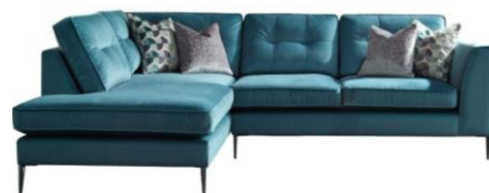
Right Hand Facing Corner Sofa (Also available in LHF)

Small: W266 x D100/160 x H86cm Large: W310 x D100/160 x H86cm