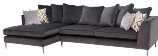
Left Hand Facing Pillow Back Chaise Sofa (Also available as RHF)

Small: W266 x D100/160 x H86cm Large: W310 x D100/160 x H86cm