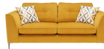
Large Sofa W195 x D100 x H86cm