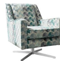
Swivel Chair W70 x D83 x H83cm

Small: W266 x D100/160 x H86cm Large: W310 x D100/160 x H86cm