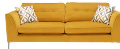
Extra Large Sofa W230 x D100 x H86cm

Regularly plump all cushions to maintain performance. Please refer to the care and commitment leaflet for further details.