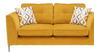
Small Sofa W160 x D100 x H86cm