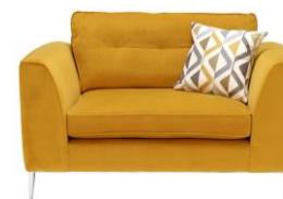
Snuggler W138 x D100 x H86cm

Small: W252 x D205 x H86cm Large: W296 x D205 x H86cm