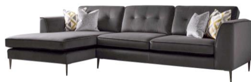
Left Hand Facing Chaise Sofa (Also available as RHF)

Small: W266 x D100/160 x H86cm Large: W310 x D100/160 x H86cm