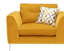
Chair W103 x D100 x H86cm